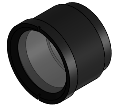
ISOMETRIC VIEW SCALE 1:1